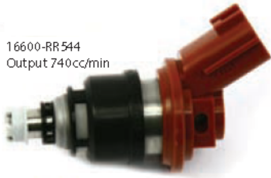
16600-RR544 Output 740cc/min