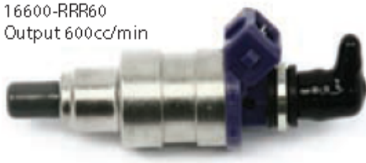
16600-RRR60 Output 600cc/min