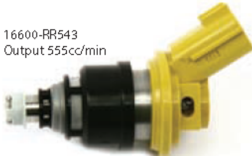
16600-RR543 Output 555cc/min