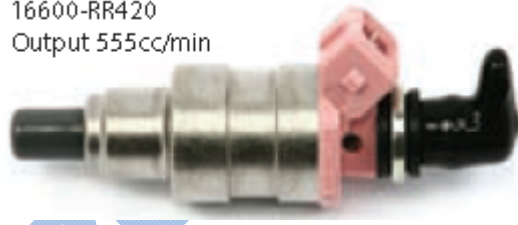
16600-RR420 Output 555cc/min